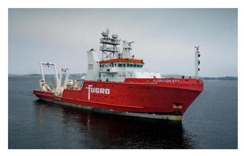
Figure 3. Fugro Galaxy