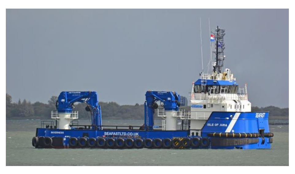
Figure 2. Isle of Jura