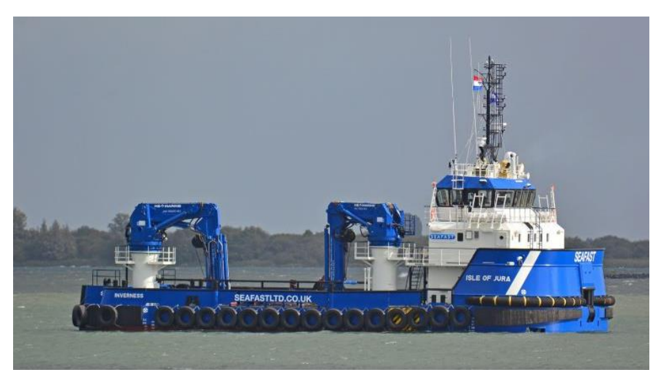
Figure 2. Isle of Jura

It is requested that other vessels transiting and operating in proximity to the area where recovery operations will be undertaken maintain a safe distance and transit at a reduced speed.