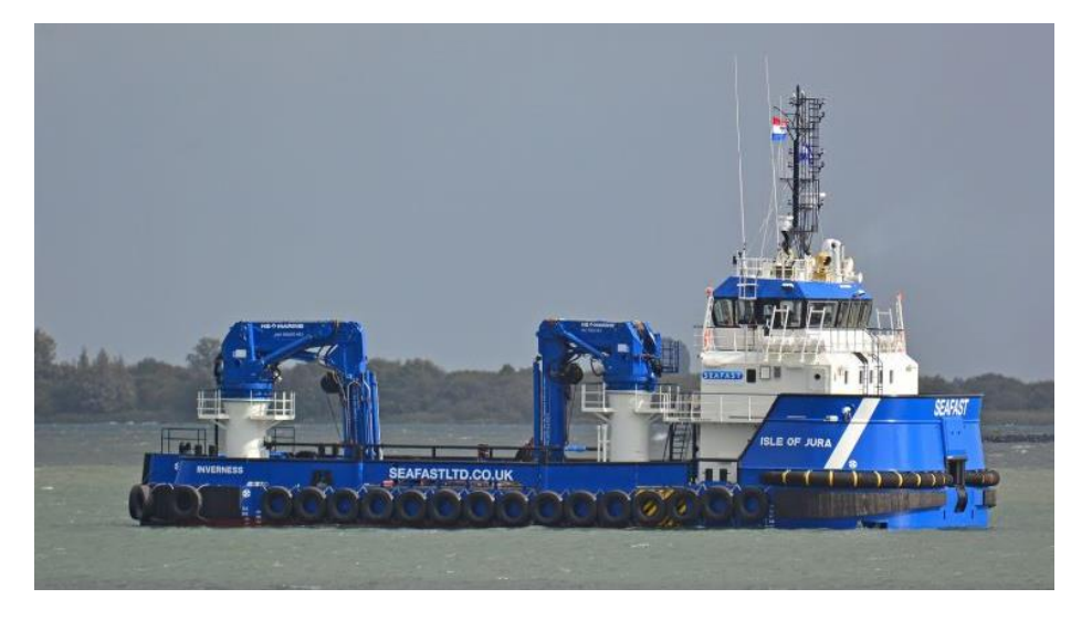
Figure 2. Isle of Jura

It is requested that other vessels transiting and operating in proximity to the area where recovery operations will be undertaken maintain a safe distance and transit at a reduced speed.