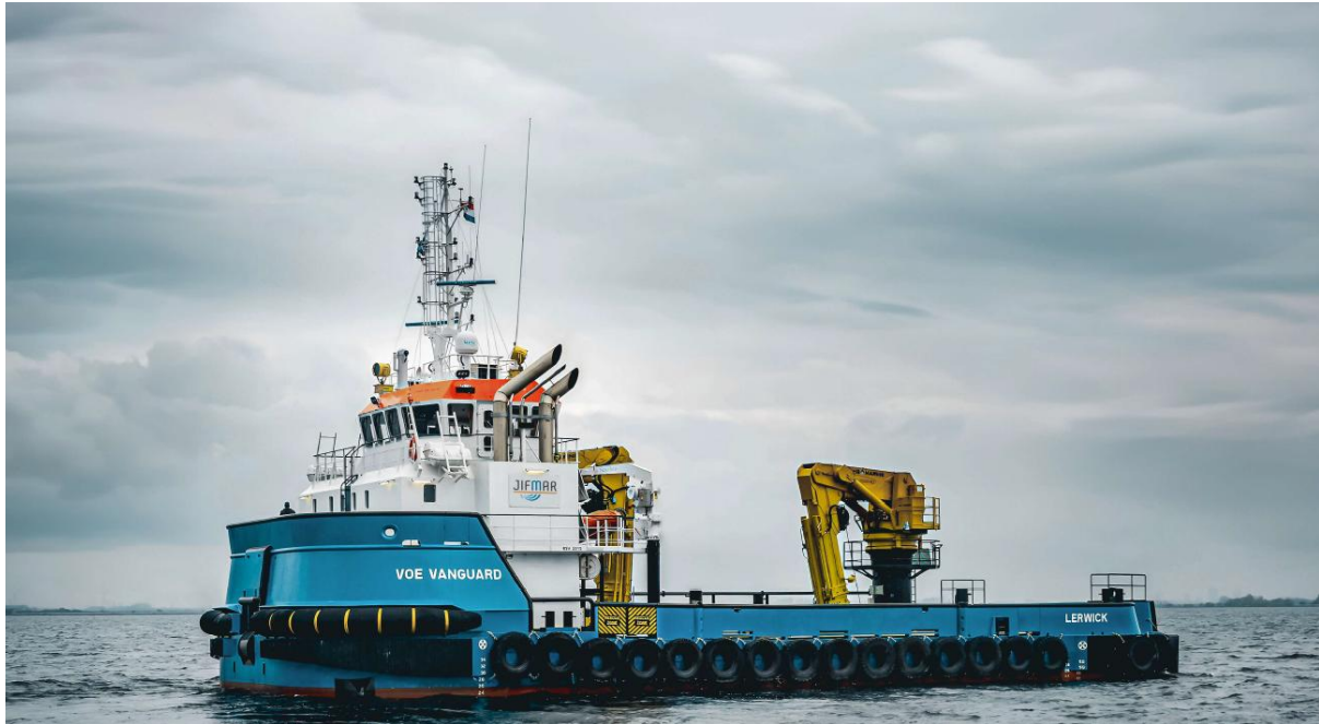
Figure 2 Voe Vanguard

The survey will be carried out from the Voe Vanguard.