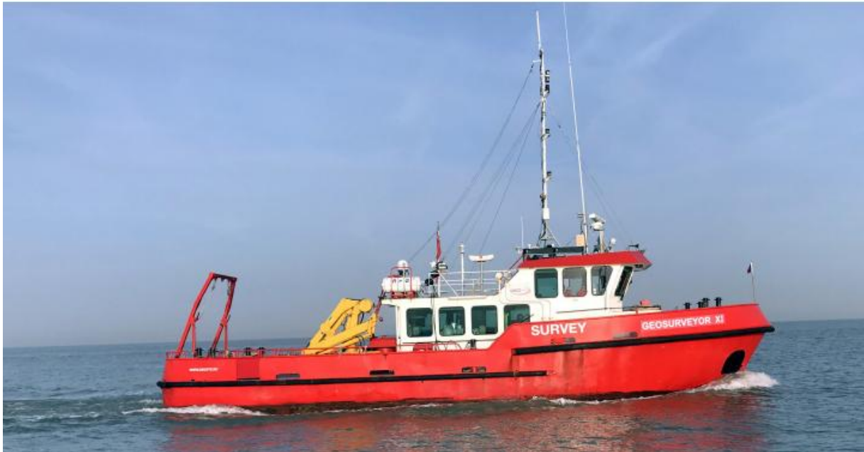
Figure 2 Geosurveyor XI

The survey will be carried out from the Geosurveyor XI.