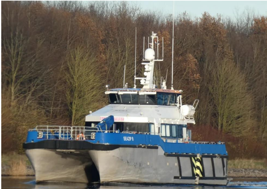
Figure 3. Seazip 8

The foundation GVI operations will be completed by the crew transfer vessel Seazip 8.