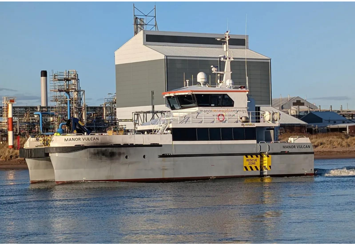
Figure 2. Manor Vulcan

The foundation GVI operations will be completed by the crew transfer vessel Manor Vulcan.