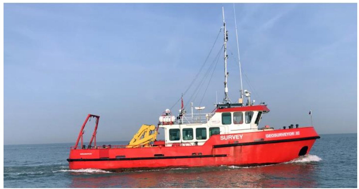
Figure 3 Geosurveyor XI

The survey will be carried out from the Geosurveyor XI.