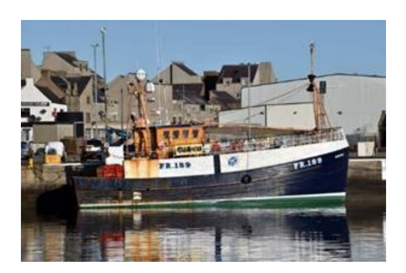
Figure 6. GV Bountiful