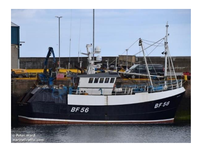
Figure 5. GV Solstice