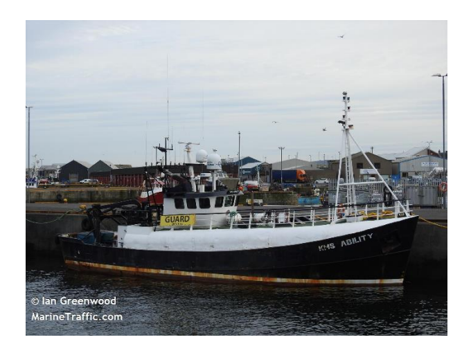
Figure 4. GV Ability