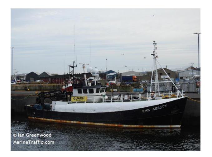
Figure 3. GV Ability