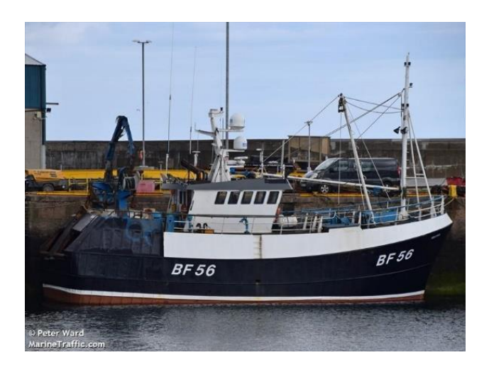
Figure 4. GV Solstice