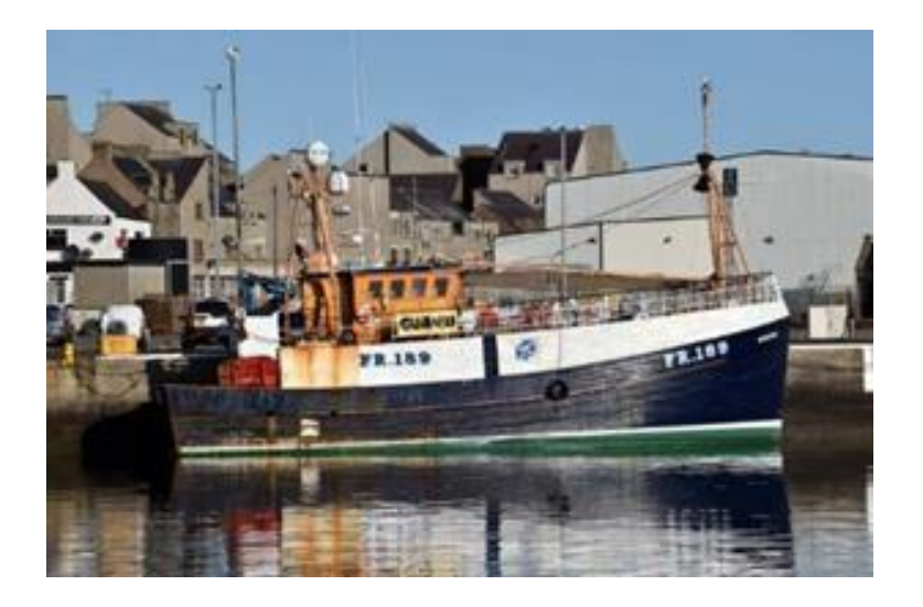
Figure 5. GV Bountiful