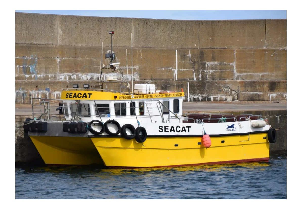
Figure 3: Seacat Support Vessel