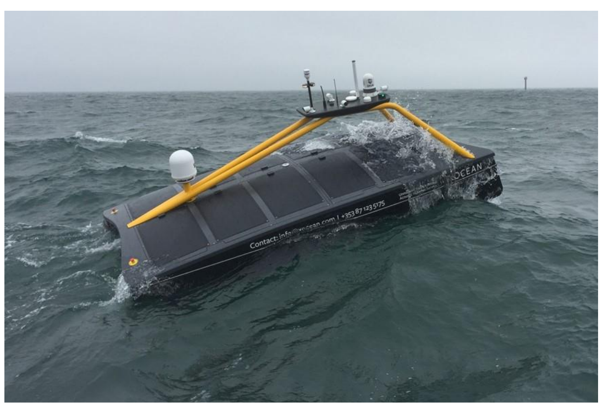
Figure 2: X-25