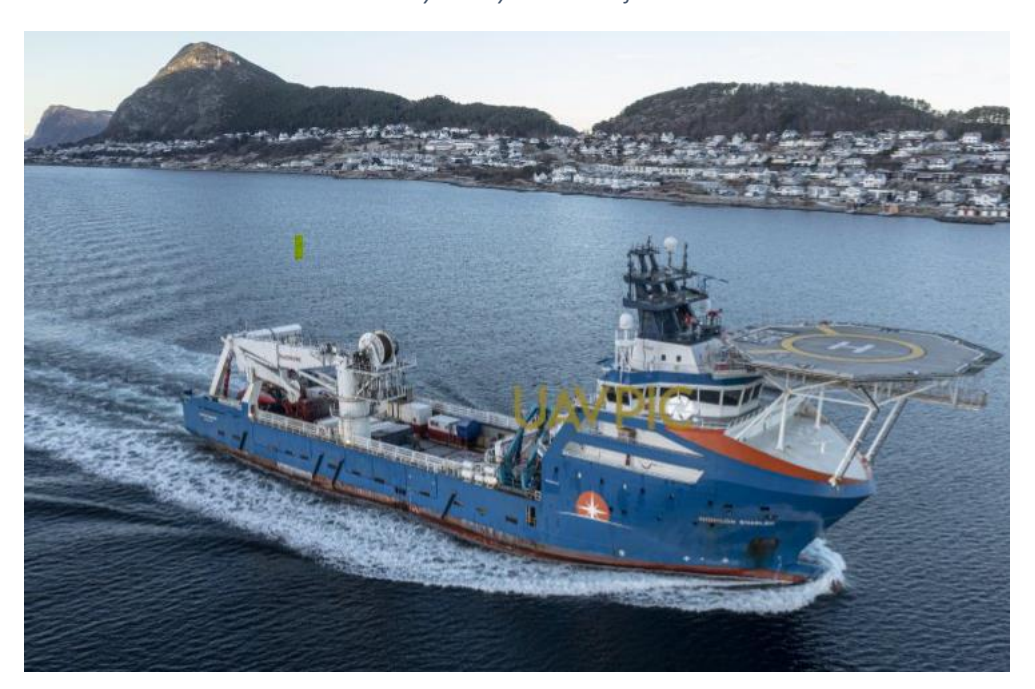
Figure 2. North Sea Enabler — photo of the vessel (Formerly Horizon Enabler)