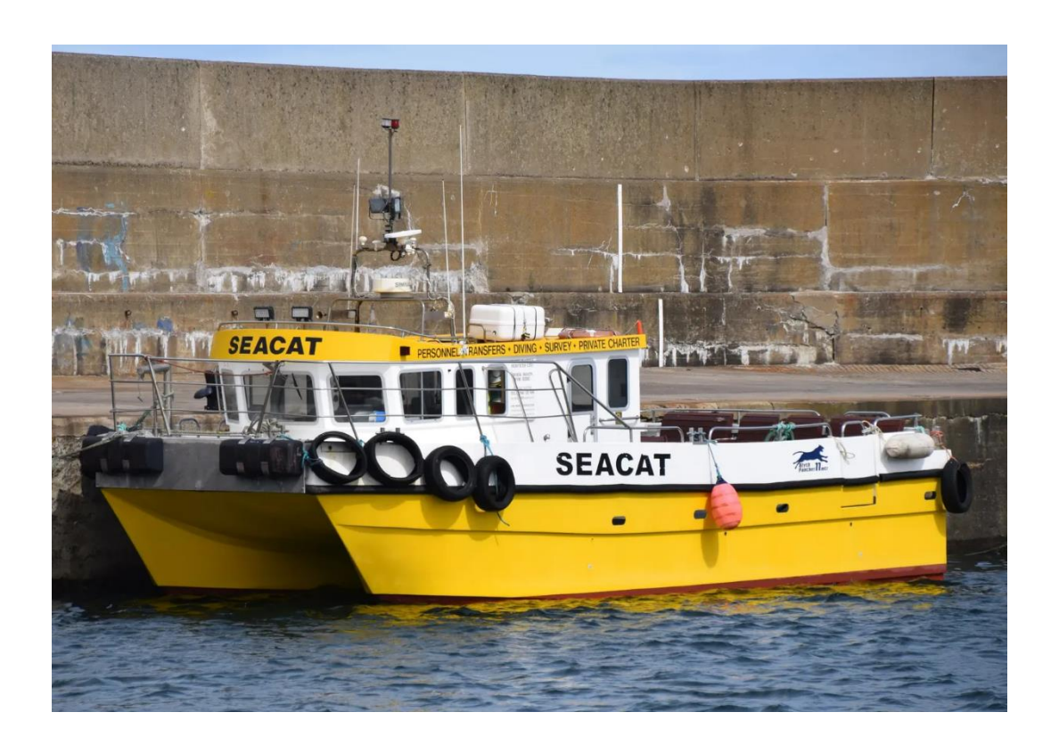
Figure 3: Seacat Support Vessel