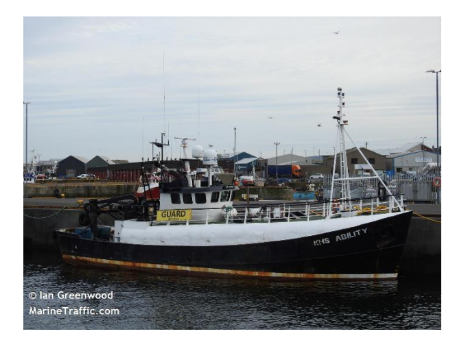
Figure 3. GV Ability