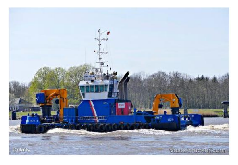
Figure 3. Forth Jouster

Table 2. Forth Jouster General Information