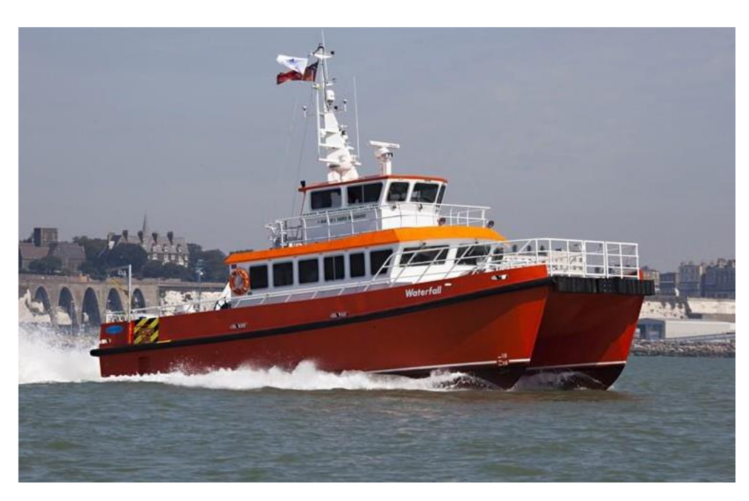
Figure 2. Waterfall – photo of the vessel