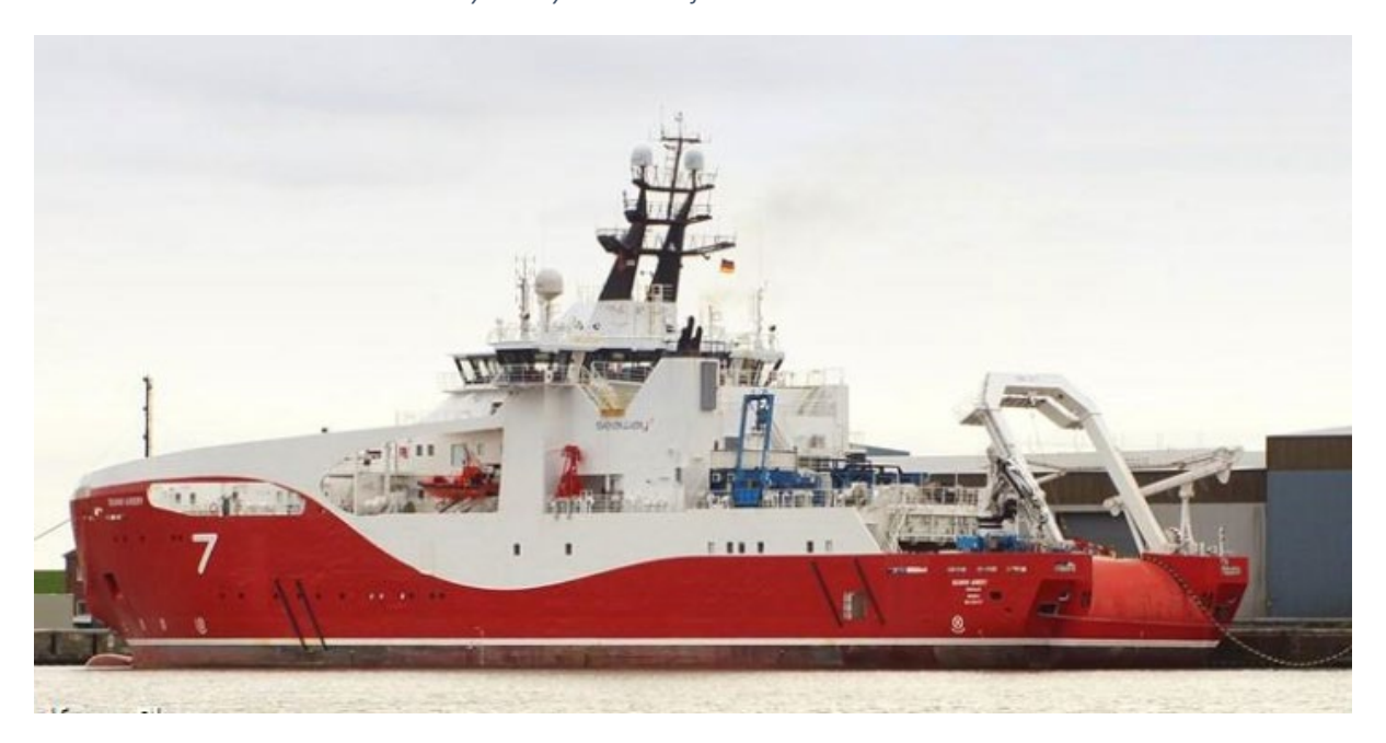
Figure 2. Seaway Aimery – photo of the vessel