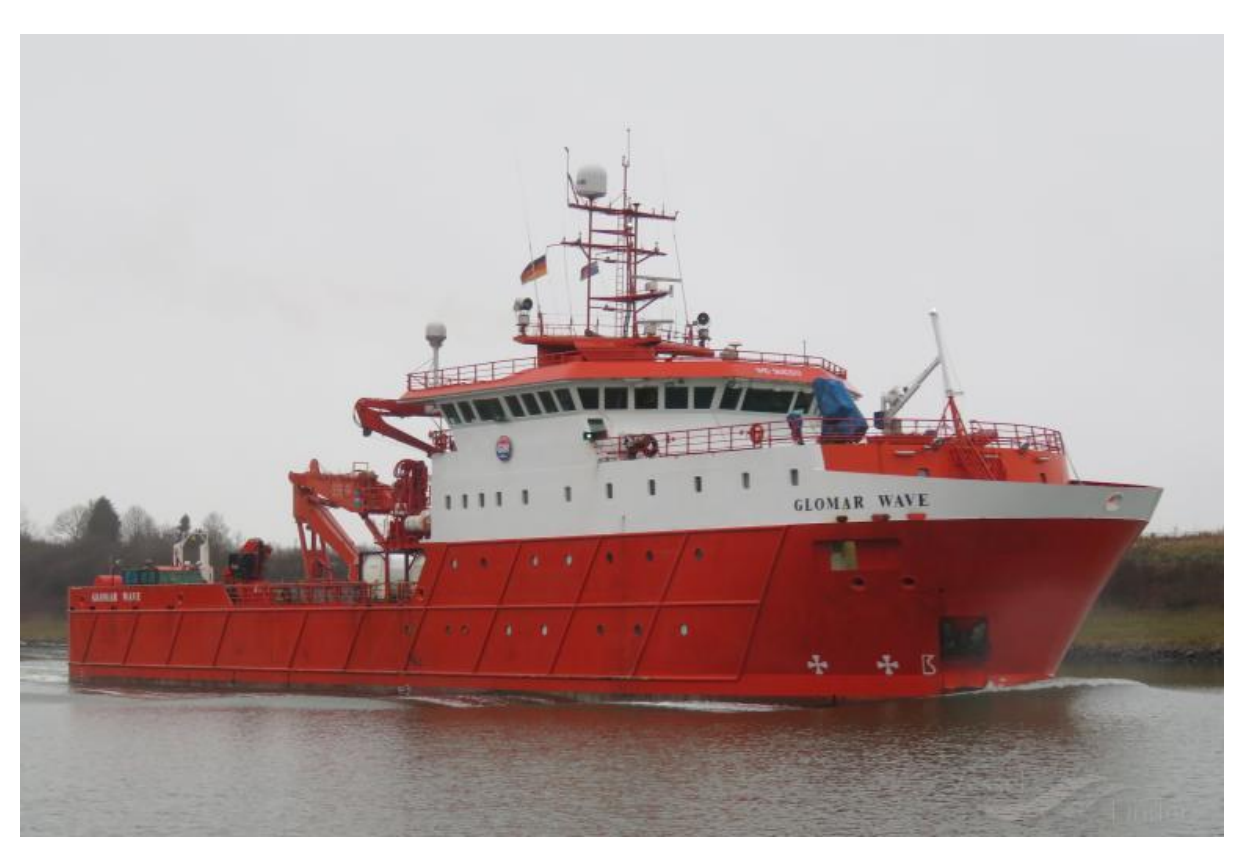
Figure 2. Glomar Wave – photo of the vessel