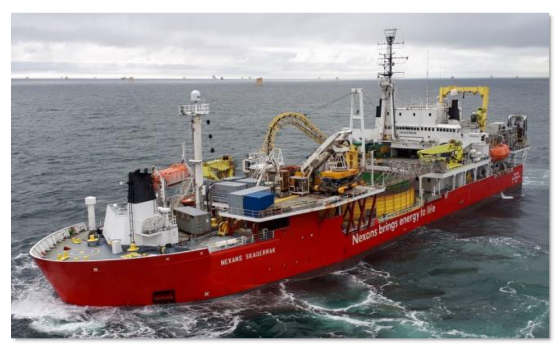
Figure 2. PLGR Vessel 'C/S Nexans Skagerrak'