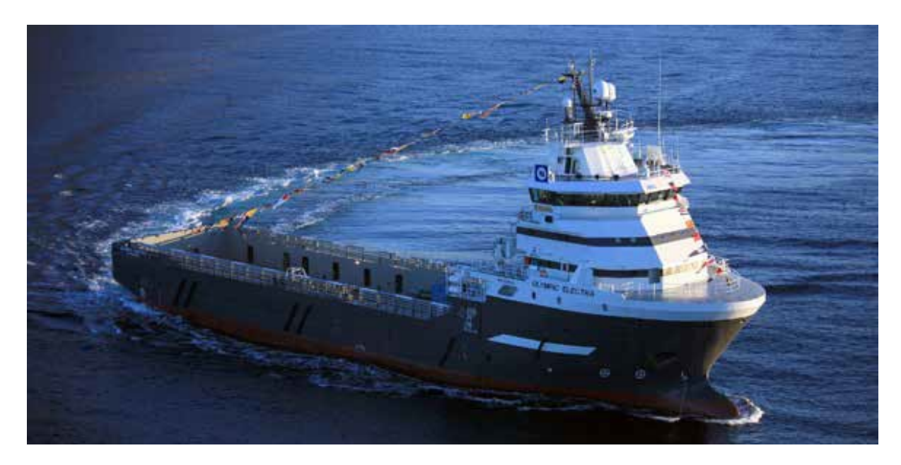
Figure 2. Olympic Electra – photo of the vessel