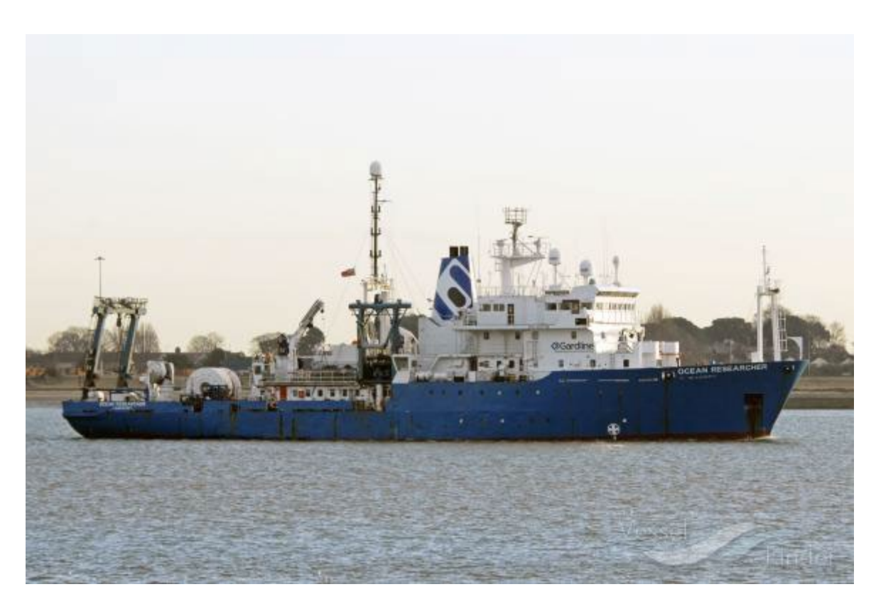
Figure 4. Ocean Researcher – photo of the vessel