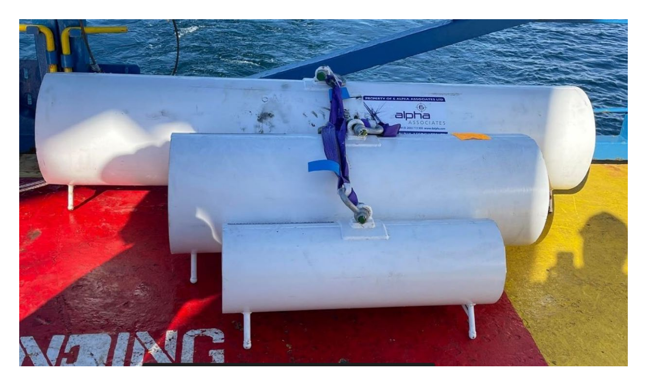
Figure 2. Ocean Researcher – Surrogate Items

Three metal cylinders c/w recovery lines have been deployed to the seabed as part of the on going survey works. These are intended to be recovered as soon as practicable. Recovery date is expected to be before 22/08/2022