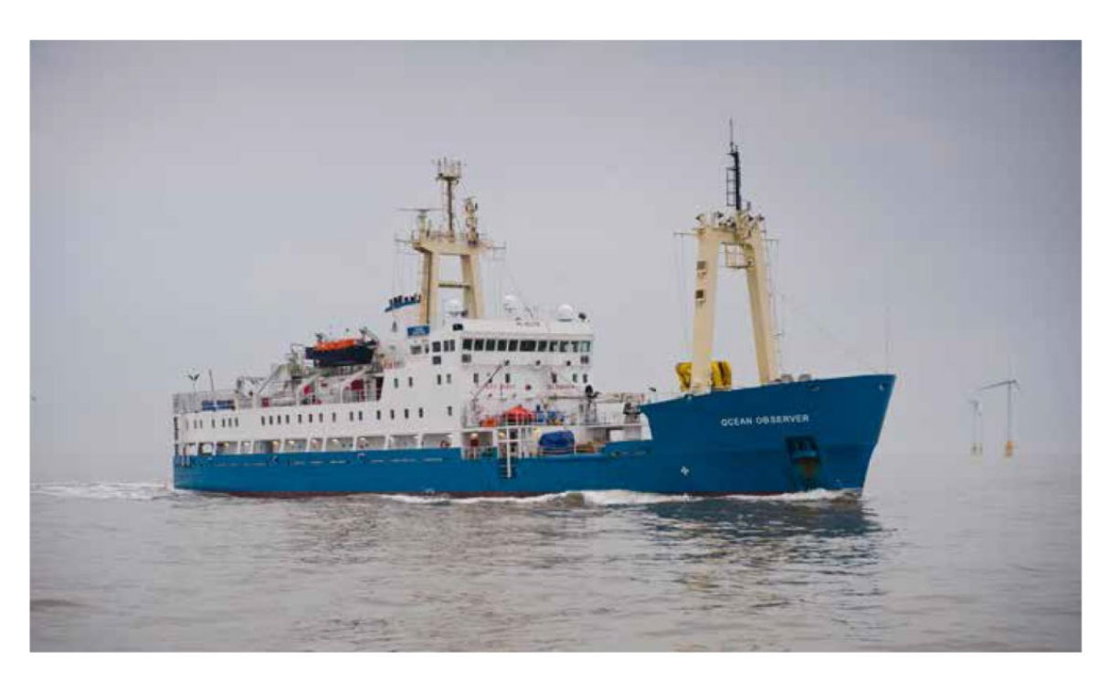
Figure 2. Ocean Observer – photo of the vessel