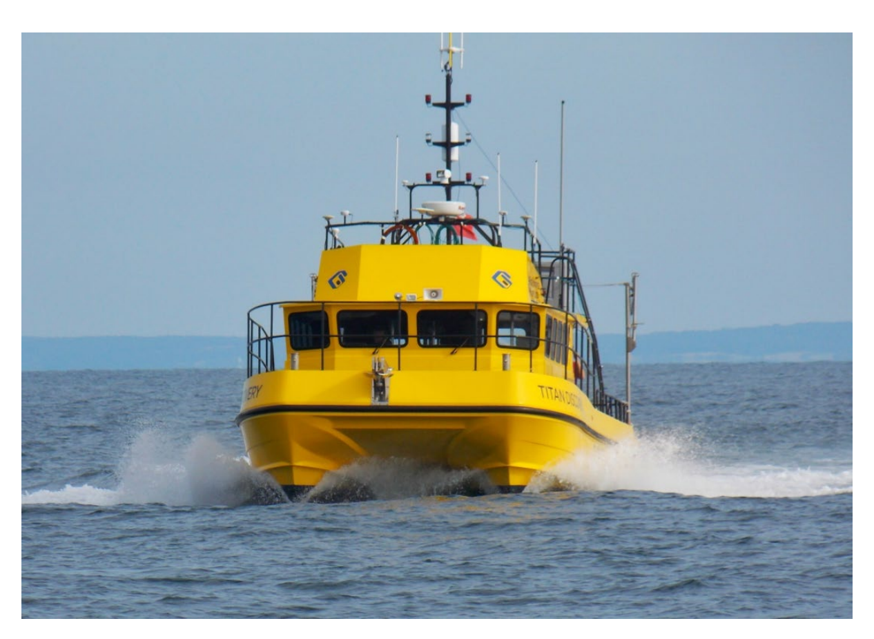
Figure 2. Titan Discovery – photo of the vessel