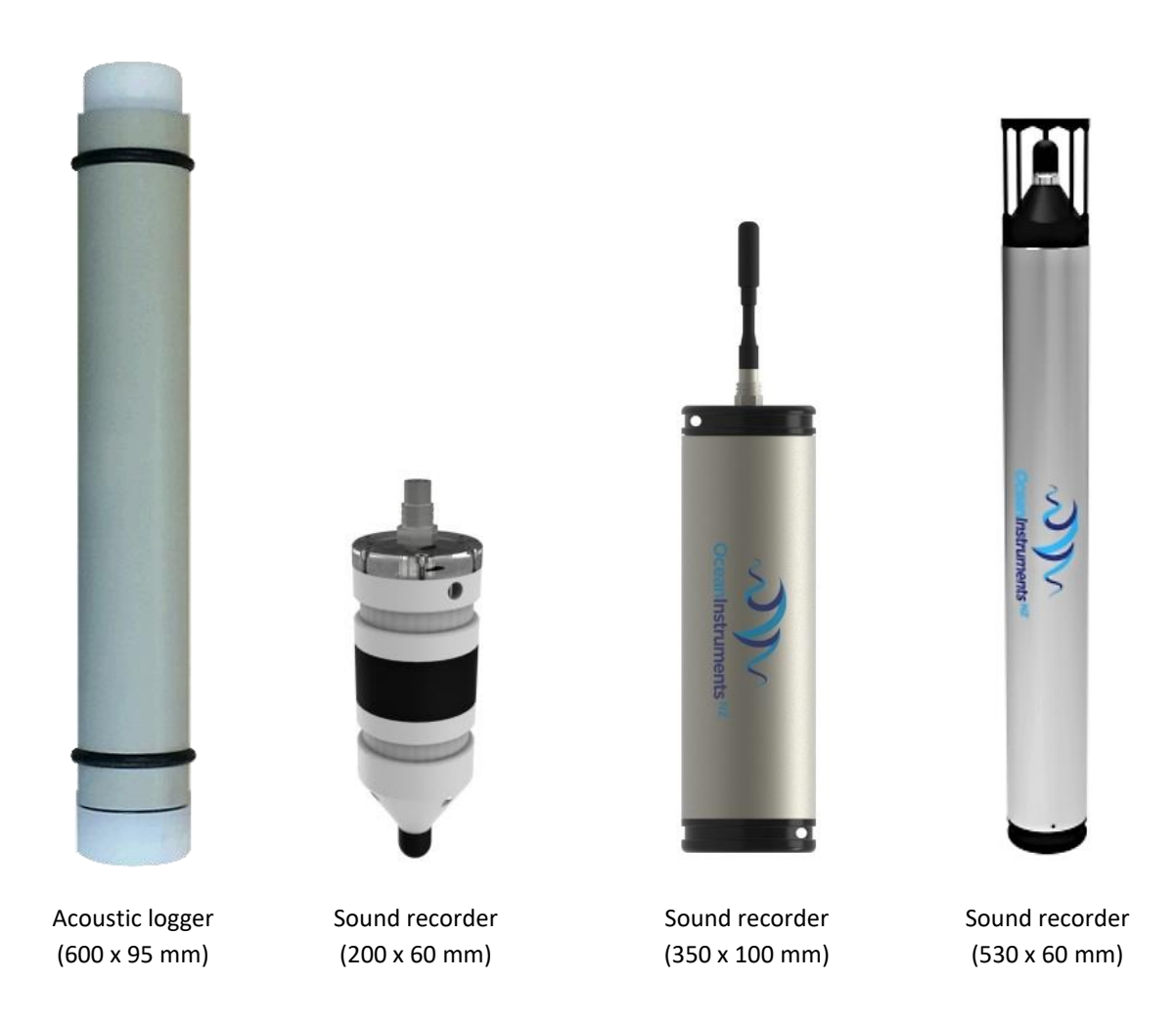
Figure S 2 Examples of equipment which the above moorings support.