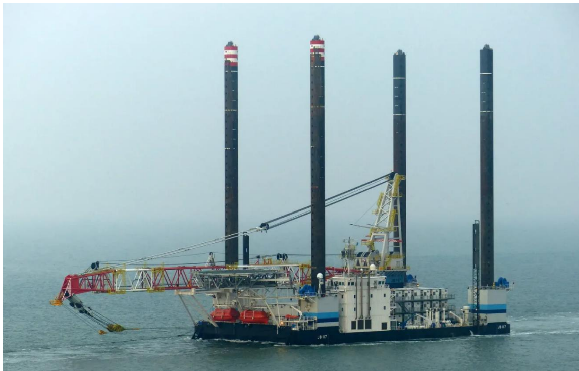
Figure 3 – JB 117