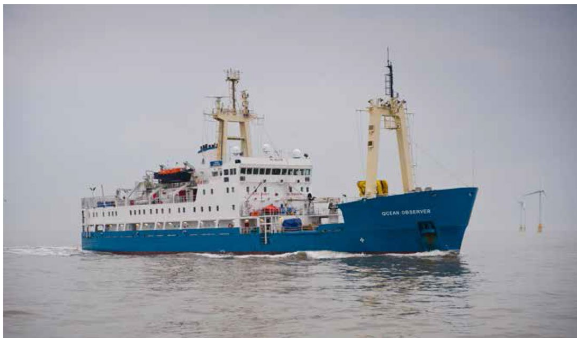
Figure 2. Ocean Observer – photo of the vessel