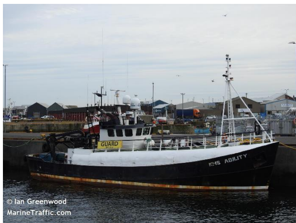
Figure 3. GV Ability