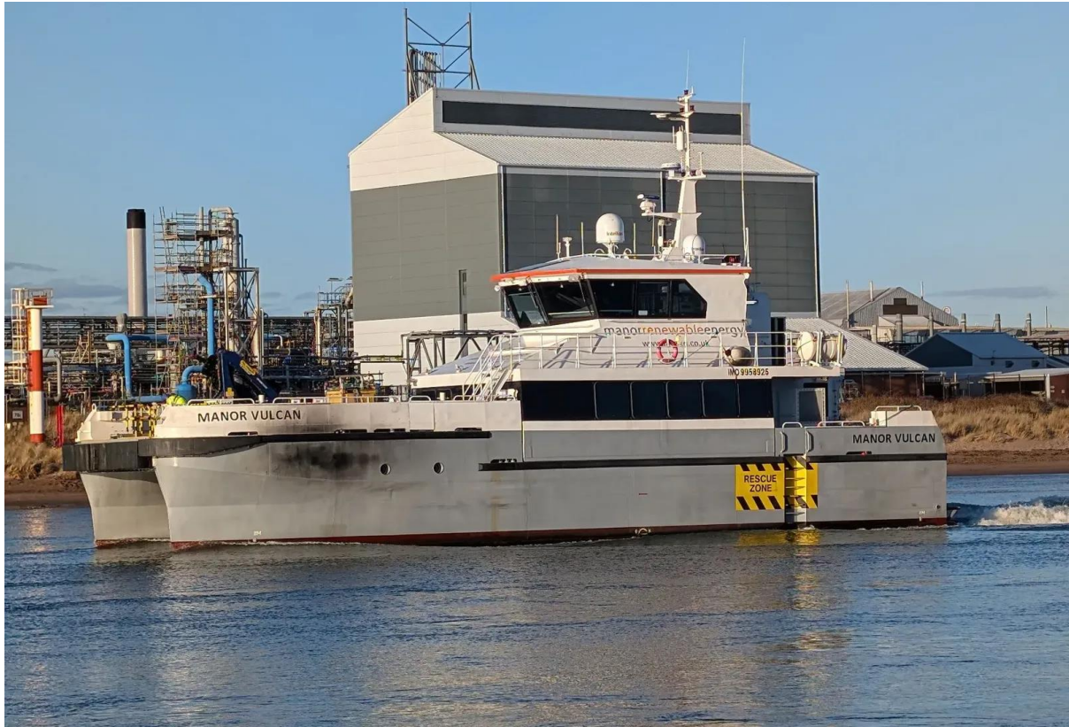
Figure 2. Manor Vulcan

The foundation GVI operations will be completed by the crew transfer vessel Manor Vulcan.