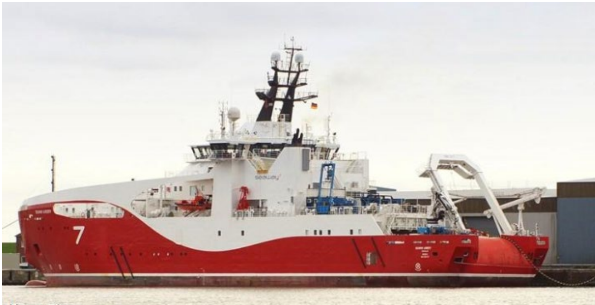
Figure 2. Seaway Aimery – photo of the vessel