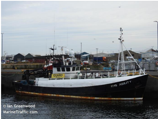
Figure 4. GV Ability