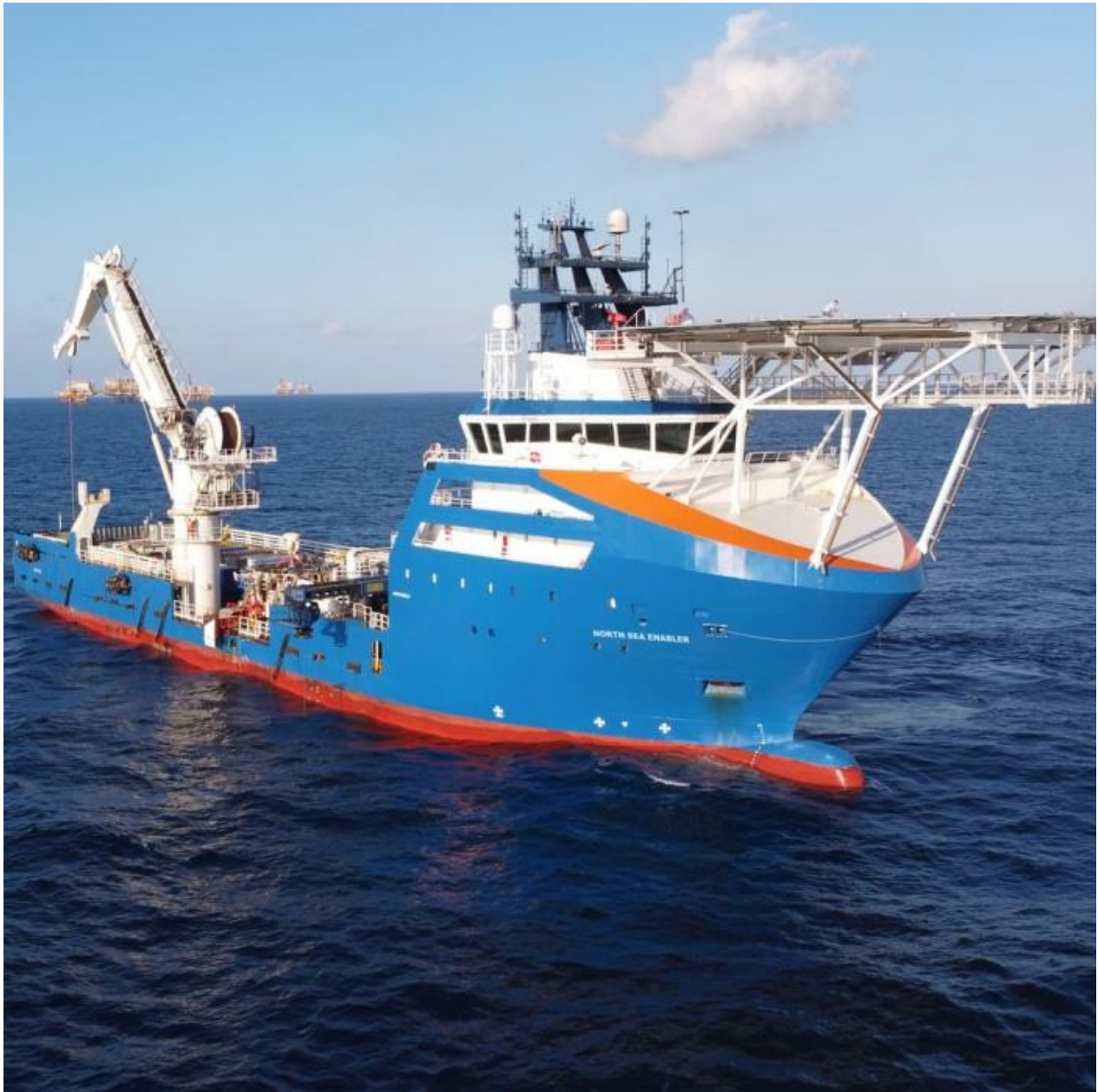
Figure 3. North Sea Enabler