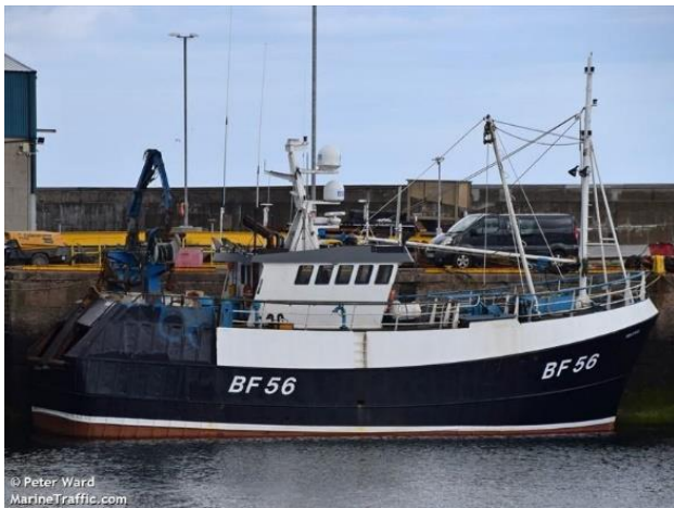
Figure 5. GV Solstice