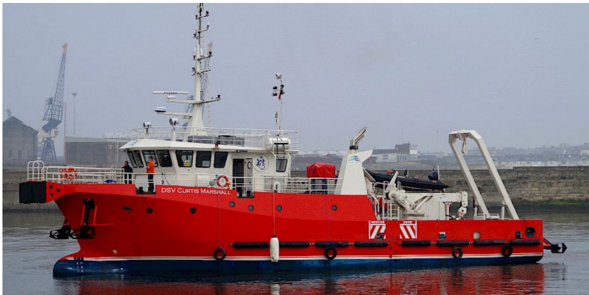
Figure 2. DSV Curtis Marshall – photo of the vessel