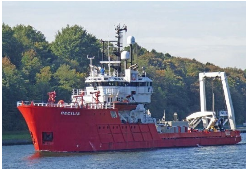
Figure 2. Northern Cecilia