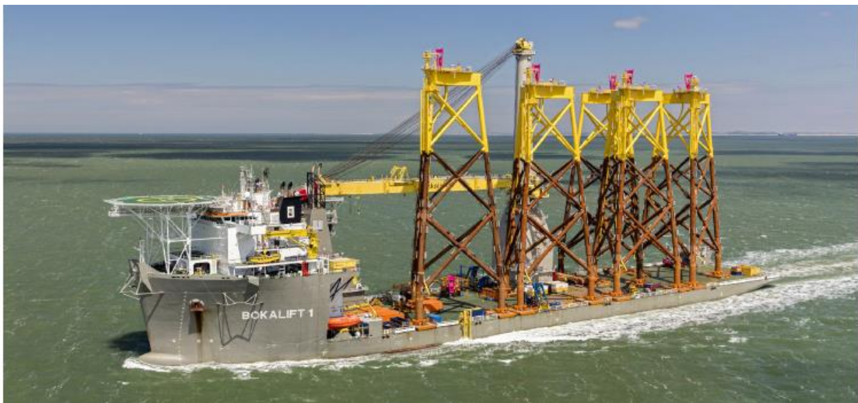
Figure 3. Bokalift1