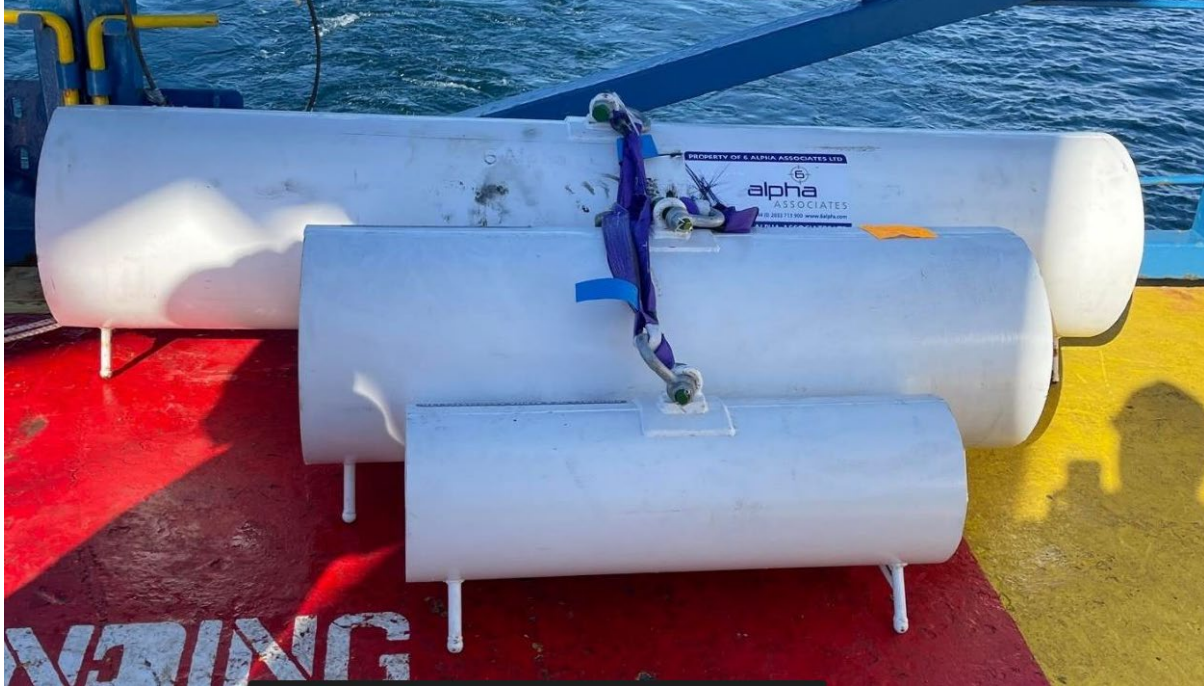
Figure 2. Ocean Researcher – Surrogate Items

Three metal cylinders c/w recovery lines have been deployed to the seabed as part of the on going survey works. These are intended to be recovered as soon as practicable. Recovery date is expected to be before 22/08/2022