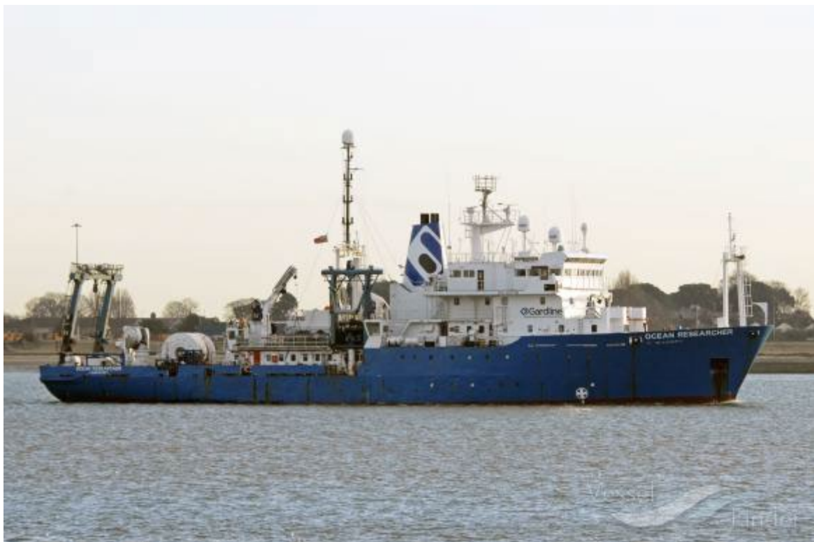
Figure 4. Ocean Researcher – photo of the vessel