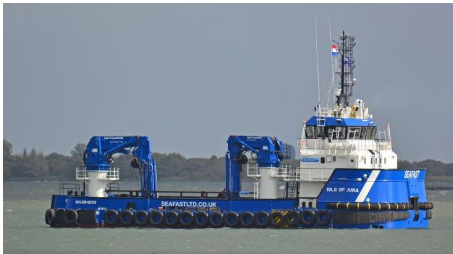
Figure 2. Isle of Jura

It is requested that other vessels transiting and operating in proximity to the area where recovery operations will be undertaken maintain a safe distance and transit at a reduced speed.