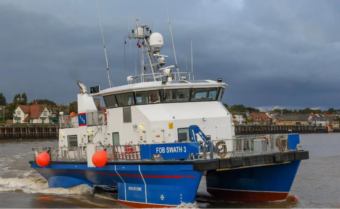
Figure 4: Fob Swath 3