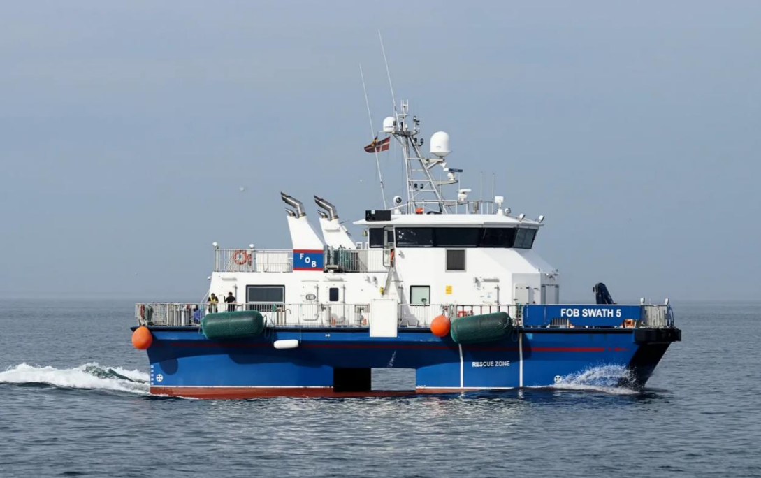
Figure 5: Fob Swath 5