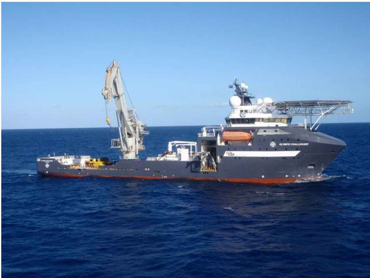
Figure 2. Olympic Challenger – photo of the vessel