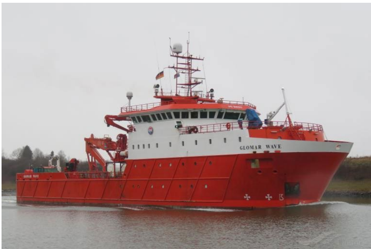
Figure 2. Glomar Wave – photo of the vessel