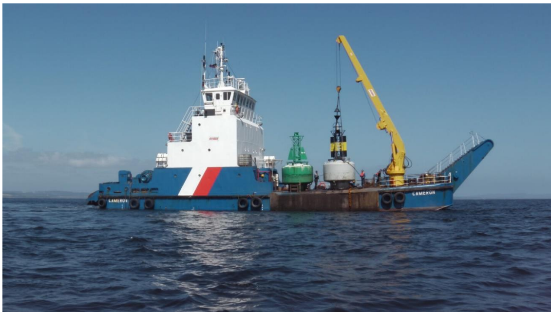
Figure 3. MV Cameron – photo of the vessel