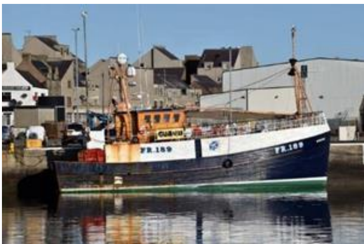
Figure 5. GV Bountiful