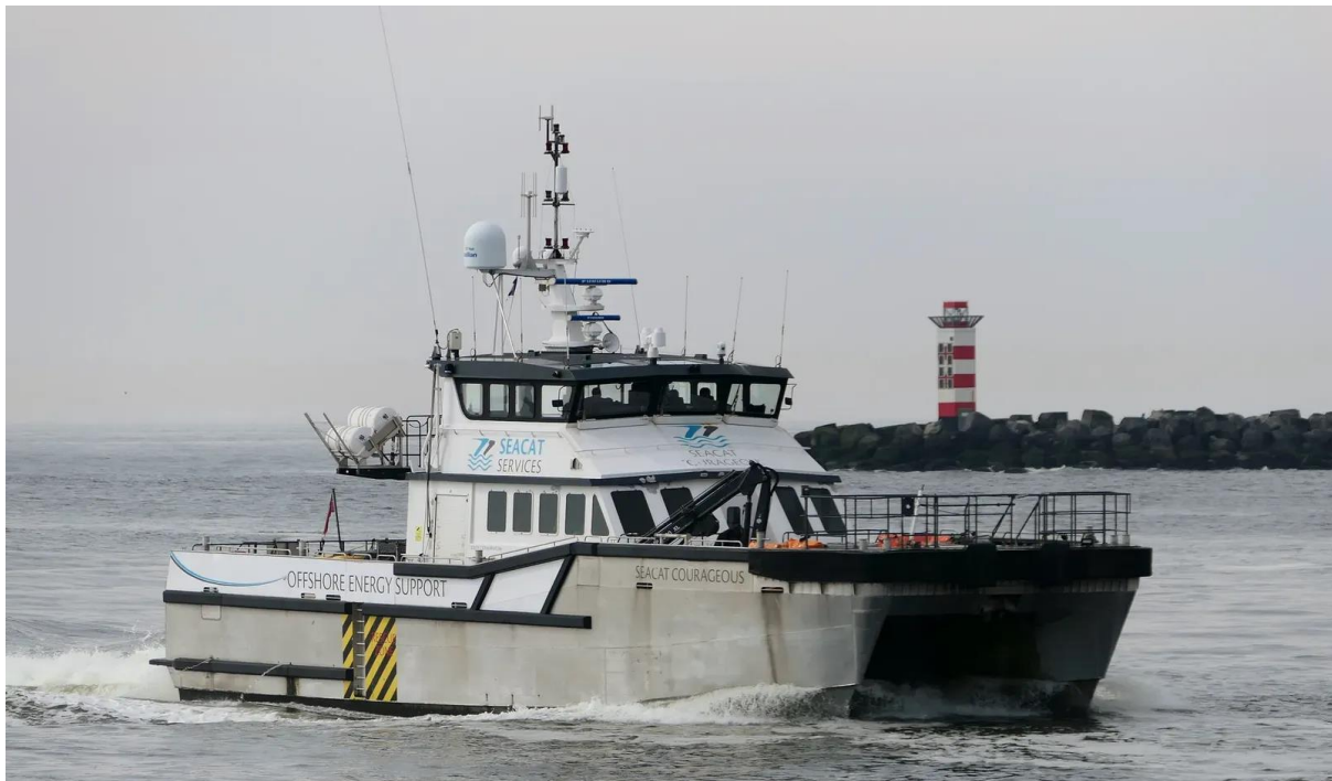
Figure 2. Seacat Courageous – photo of the vessel