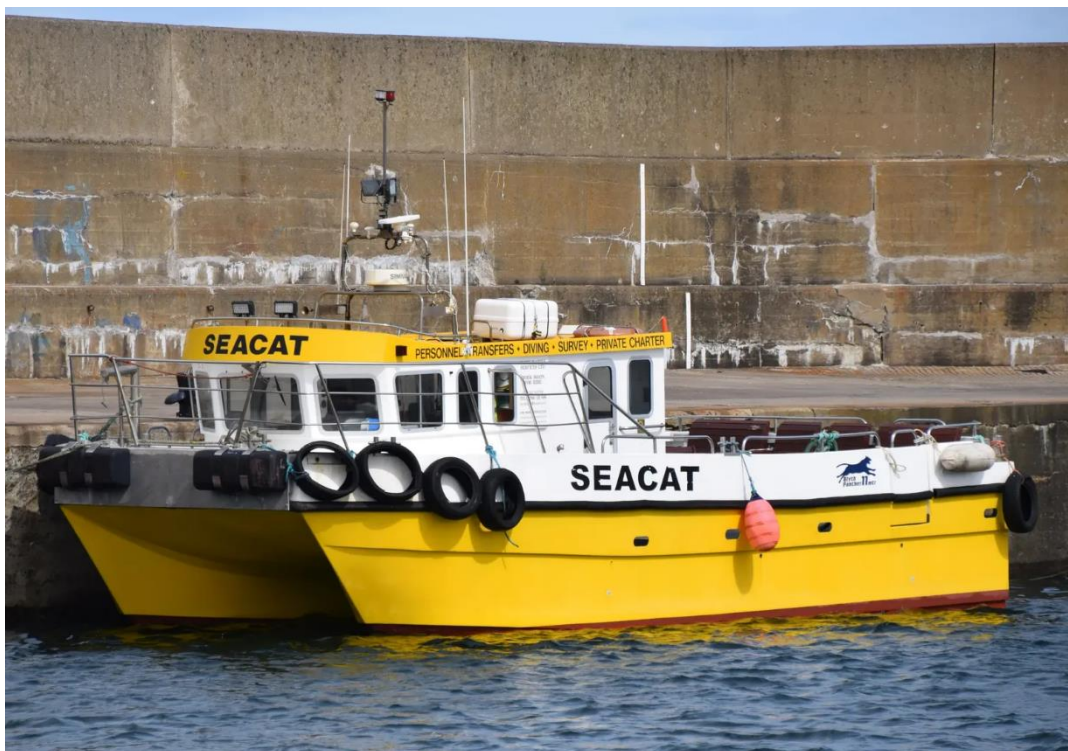
Figure 3: Seacat Support Vessel