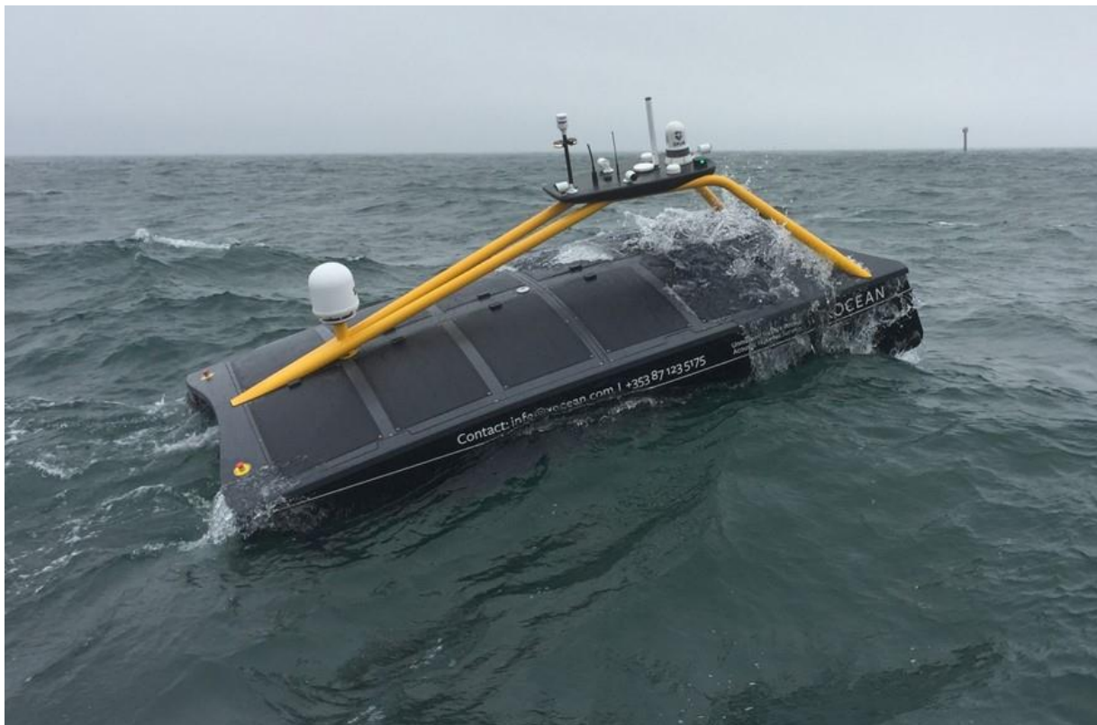
Figure 2: X-04 Unmanned Survey Vessel