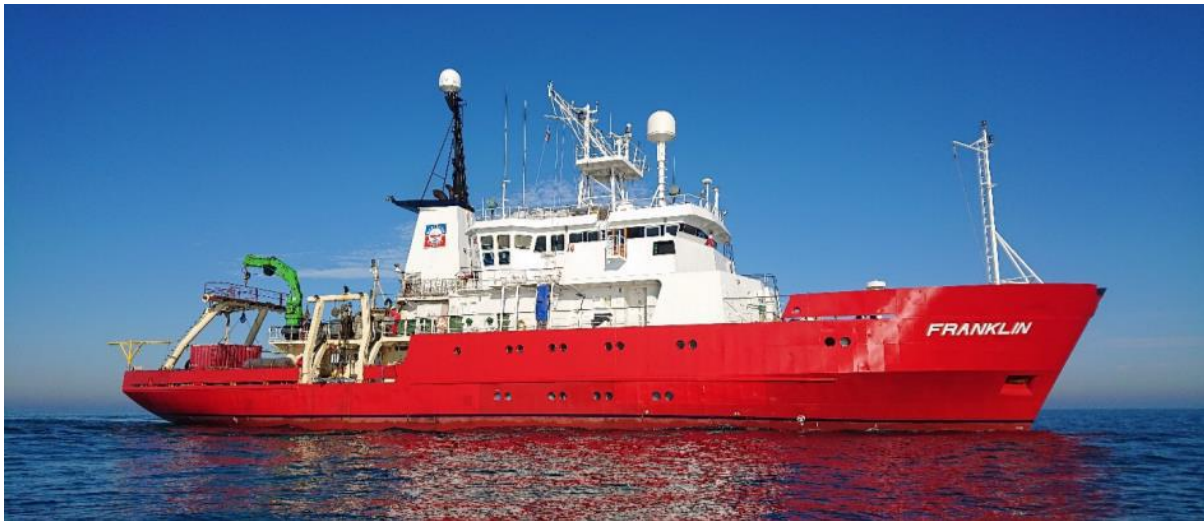
Figure 2. Northern Franklin