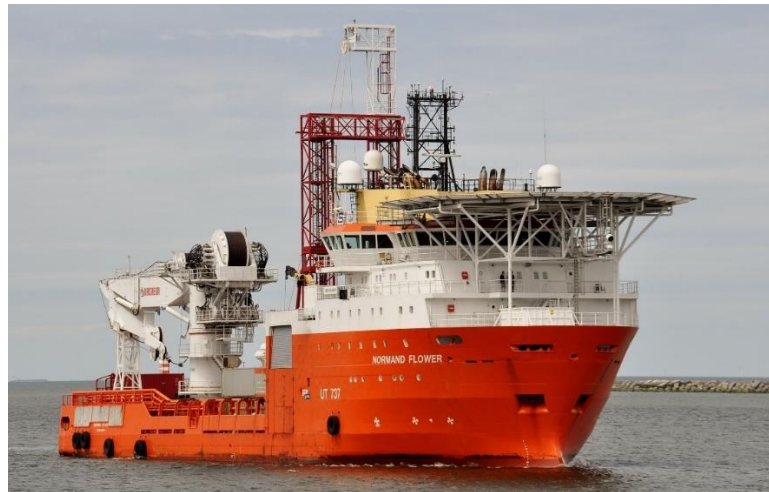
Figure 2. Normand Flower

Geophysical operations will be carried out by Fugro Galaxy for approximately one week, weather dependent. Fugro Galaxy will be towing survey equipment the vessel will require large turning circles therefore it is requested that all vessels operating within this area keep their distance (at least 2000m) and pass at minimum speed to reduce vessel wash.