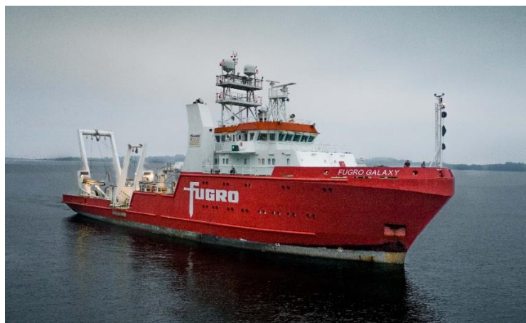
Figure 3. Fugro Galaxy